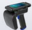
DLR-SLED02-EU 3138 Sled w/pogo pins DLR-SLED03-EU 3138 Sled w/USB-C DLR-SLED02-US 3138 Sled w/pogo pins DLR-SLED03-US 3138 Sled w/USB-C